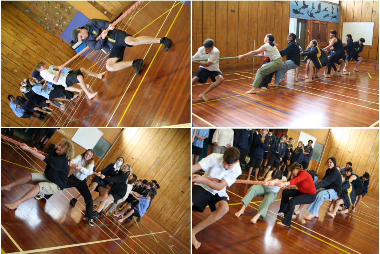
MILES 3 - NEW REIGNING CHAMPS FOR TUG-O-WAR