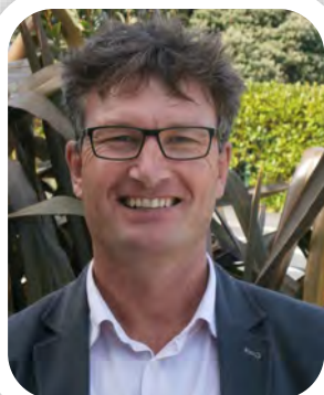
TENA KOUTOU MATUA MA

It seems incredible we are already into week six of the term! Keeping the school running smoothly and people trying to stay healthy have been the real challenges of