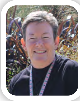
TENA KOUTOU MATUA MA