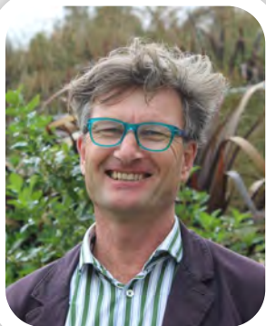
TENA KOUTOU MATUA MA

Term 4 is a time of celebrations, exams, outdoor adventures and farewells.