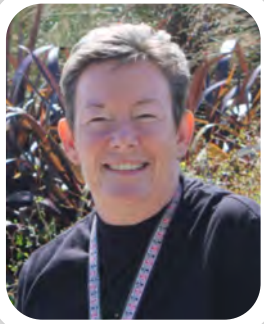
TENA KOUTOU MATUA MA

It was great to see so many of you at the college to attend our first Parent Student Teacher (PST) on Tuesday 4 April. As you know, the purpose of this